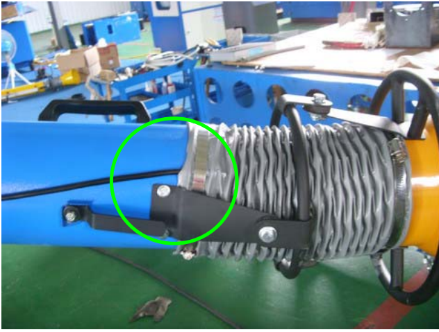
[6] Unscrew the Steel Clamp on the Nylon Hose. Connect the Light Cord through Nylon Hose to the Hood, and then fasten the Steel Clamp.