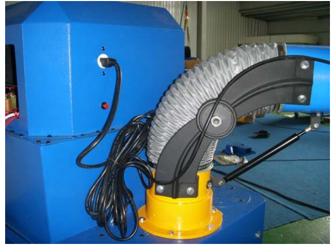
[8] Connect the Light Plug to the Socket. Roll up the remaining Cords and the assembly of Light Kit is completed.