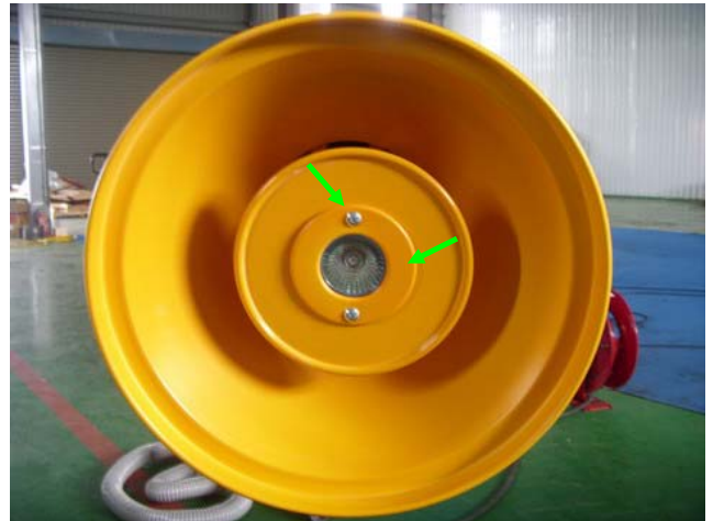
[5] Then tighten the (2) pcs of 3/16"*5/8" Phillips Head Screws originally locked the Fixing Plate.