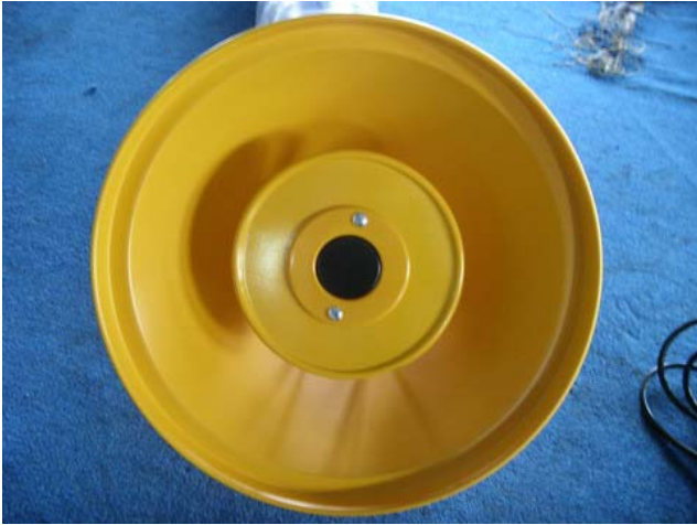
[1] Use Phillips Head Screwdriver to release (2) pcs of 3/16"*5/8" Phillips Head Screws.