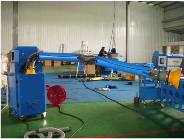
[7] Keep connecting the Light Cord along the Pipe to the Machine.