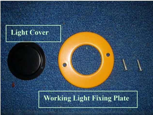
[2] Take off the Light Cover and Working Light Fixing Plate.