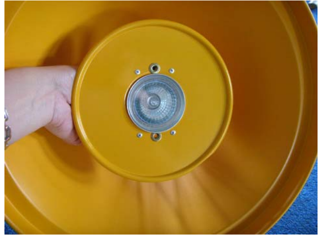
[4] Fix the Light Kit to the Supporting Plate.