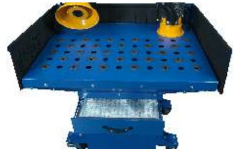
Internal filtration system

Oskar's downdraft table with filtration is designed to exhaust and filter dry impurities. The downdraft table provides the welder with dual exhaust and filtration using the fume arm and downdraft table.