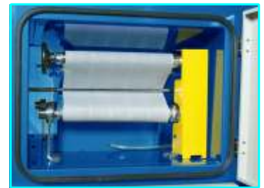
Manual rolling filter