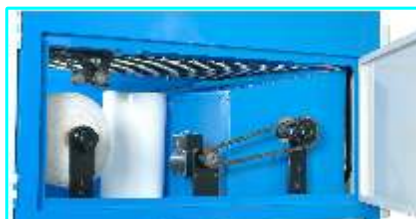
Automatic rolling filter