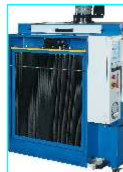
Cartridge filter (cleanable)