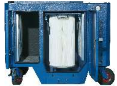
Internal filtration system

Oskar's Portable fume collector cleaner is designed to handle applications like plasma cutting, production welding and heavy dusts. The SPC-G7 incorporates 2 cartridges on a rollout tray and cartridge pulse cleaning system. The SPC-G7 is mounted on large rear wheels and swivel casters. It comes with blank offs which can be removed in favor of three 8 inch diameter Oskar fume arms.