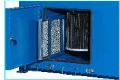
Internal filtration system